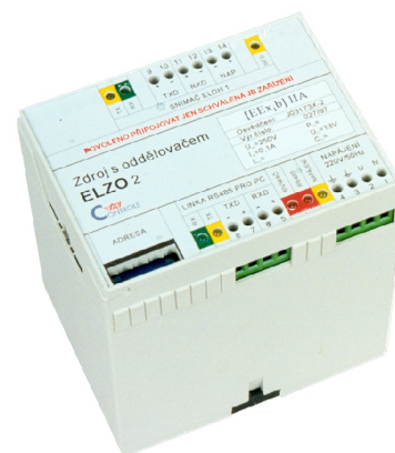
Power supply & insulator module ELZO-2

ELBC 2 system is has ATEX approval for installation in explosive hazardous area.