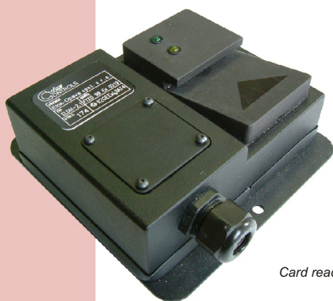
Card reader ELDH-2

Contactless smart cards seem to be just a piece of plastic. They have no visible chip contacts, need no slot to be inserted in, and can operate without a direct line of sight to the smart card reader.